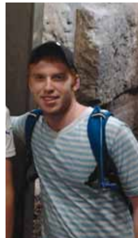
Oren New York

"For me Mechinat Otzem is the ultimate stepping stone between being an Anglo in Israel and being an Anglo Israeli. Living in Israel has always meant so much to me and now I have the possibility of doing it without feeling like a stranger"